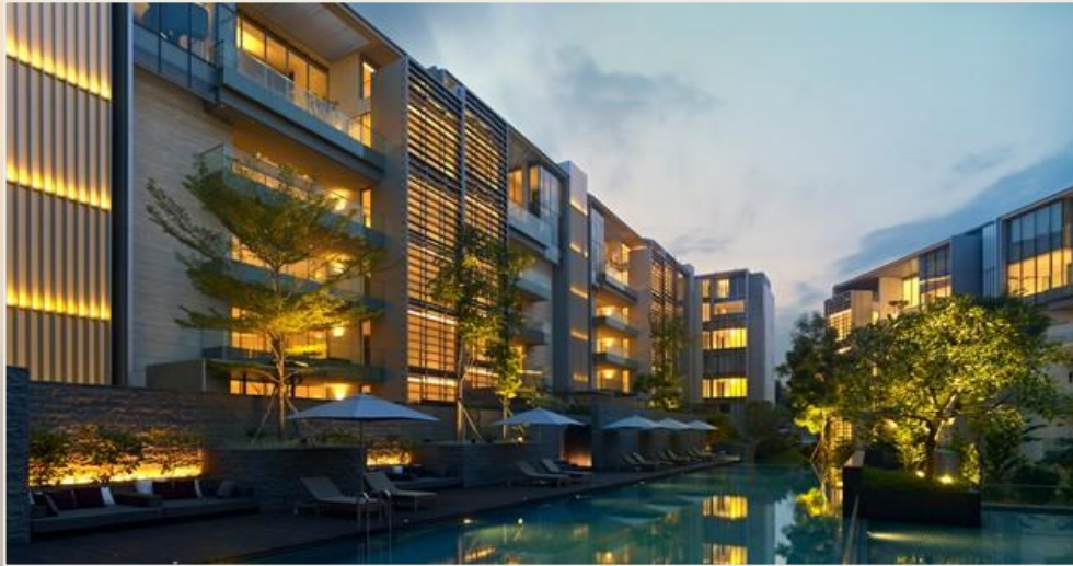
NASSIM PARK RESIDENCES